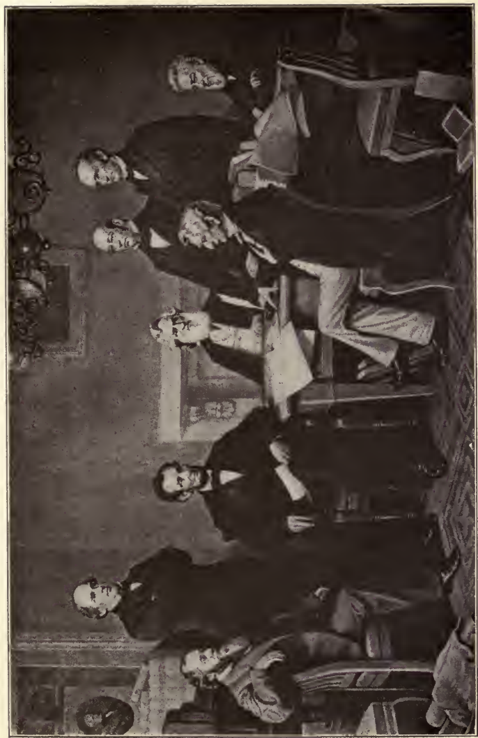
Reading of the Emancipation Proclamation before the Cabinet